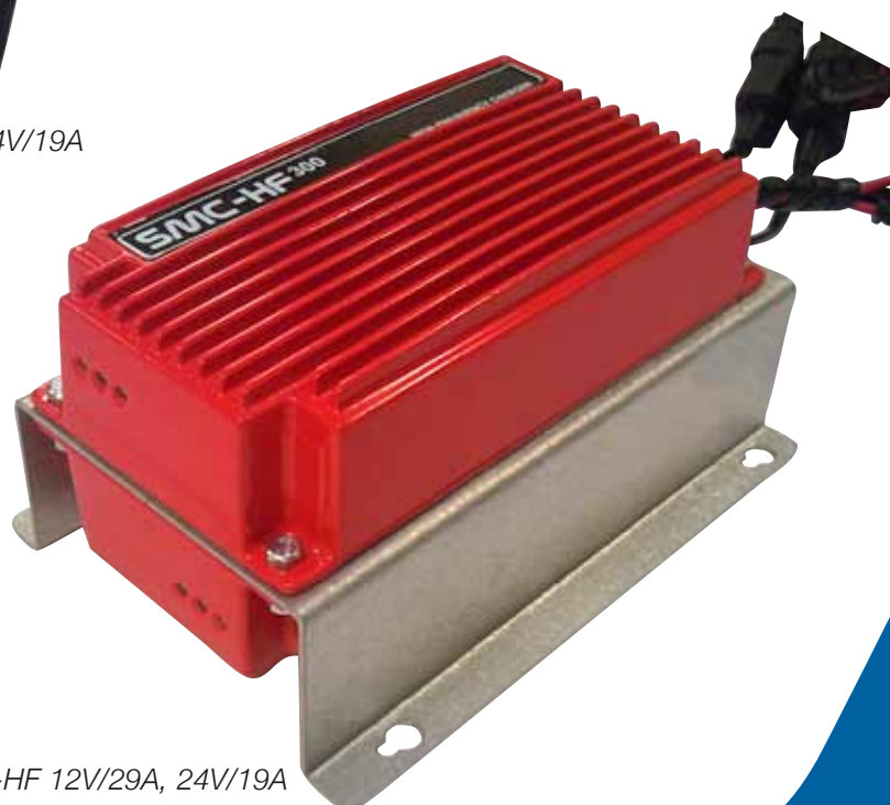
SMC-HF 12V/29A, 24V/19A