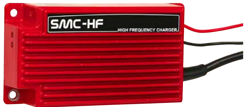
SMC-HF 12V/6A, 24V/3A