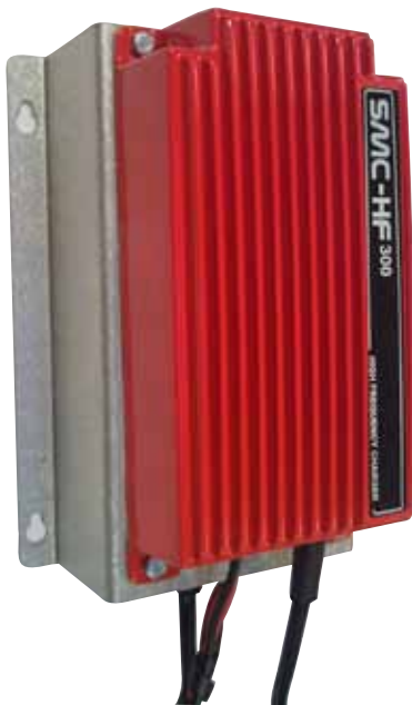
SMC-HF 12V/29A, 24V/19A